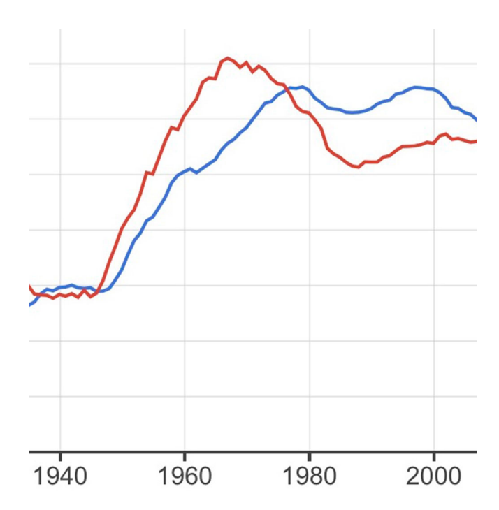
Figure 1. NGRAM of terminology.

Within the museum field, discussions of professional identity started shortly after museums began providing salaries for individuals to do the work previously done by avid volunteer collectors. An 1893 address to the Museum Association in London suggested that museum curators needed a level of education 'not dissimilar to that required for most of the learned professions' (Flower 1898/1972, 36). In 1939, the director of the American Association of Museums wrote, 'Museum work is commonly said to be one of the professions. But some people think of it otherwise' (Coleman 1939, 416). He